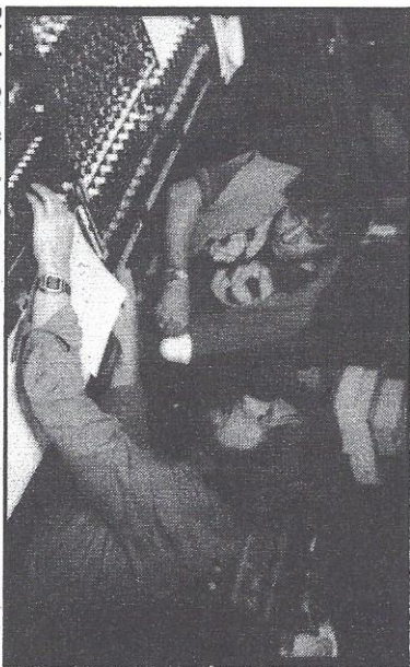
Dierks Studios in Stommeln, near Cologne.